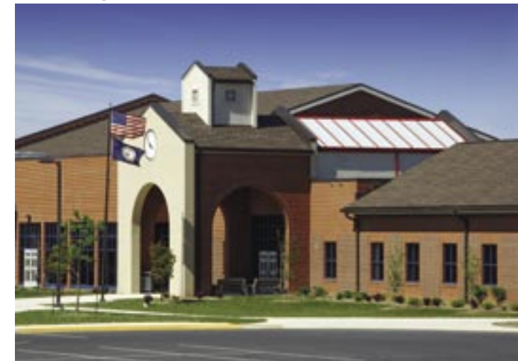
Byrd Middle School, WINCHESTER, VA