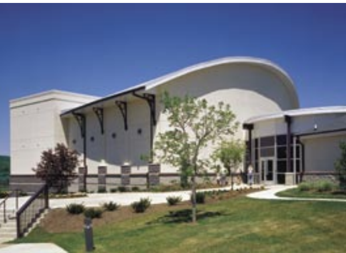
Highland School Center for the Arts, THE PLAINS, VA