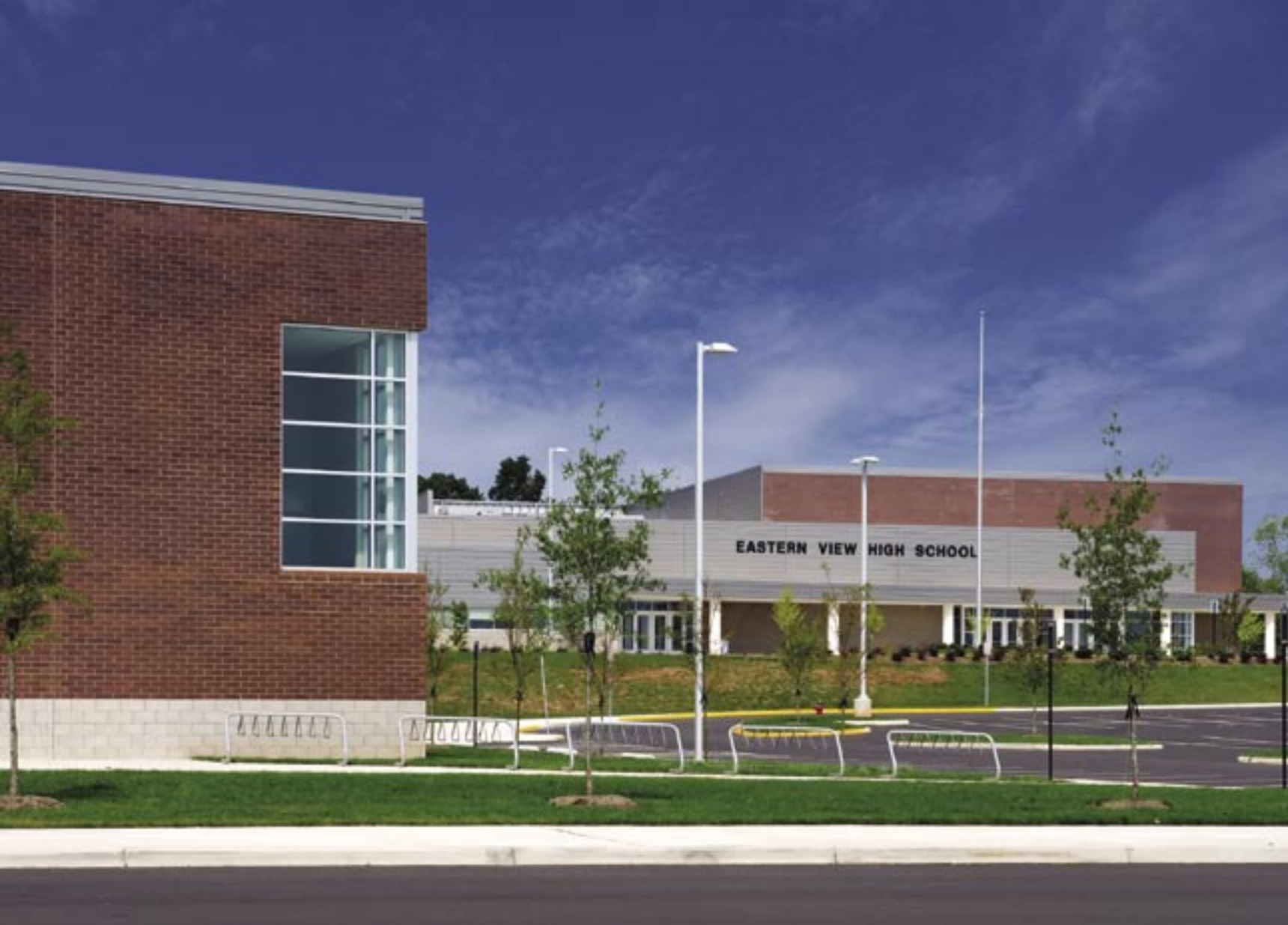
Eastern View High School, CULPEPER, VA

What else sets Shockey apart for partnership? Our clients view us as The Partner of Choice® because we always do our homework. We've taken the best of what we know about construction and brought it to bear in the public eye.