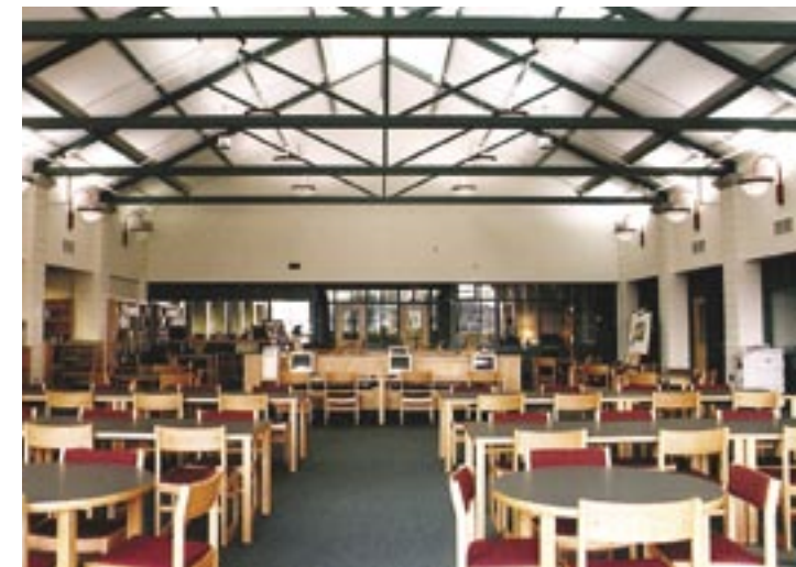
Musselman High School, BUNKER HILL, WV