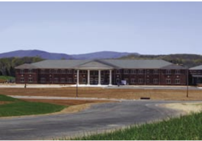
West Warren County High School, FRONT ROYAL, VA

In addition to hard-bid procurement and design-build, one very real answer might lie in the Commonwealth of Virginia's PPEA statute.