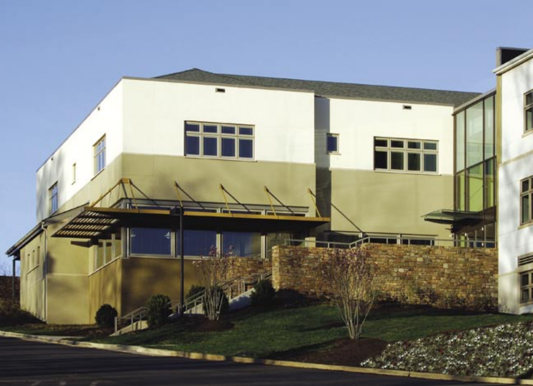
Wakefield School, THE PLAINS, VA

It's a fact: Environment enhances learning. Learning is affected by physical factors such as building age and condition, visual factors and lighting. School spaces designed to maximize efficiency in all types of things—things like circulation, access and multi-use—allow more time and energy for learning activities.