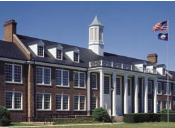
James Wood Middle School, WINCHESTER, VA