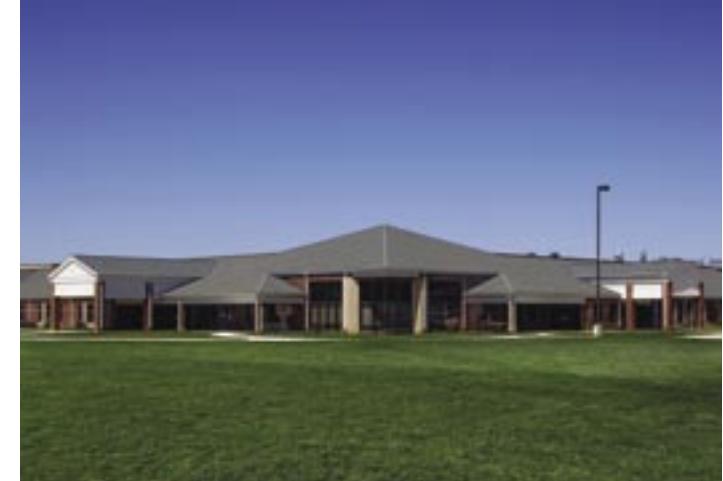
East Warren County High School, FRONT ROYAL, VA