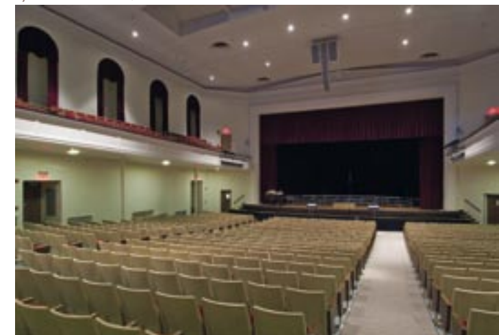
John Handley High School, WINCHESTER, VA