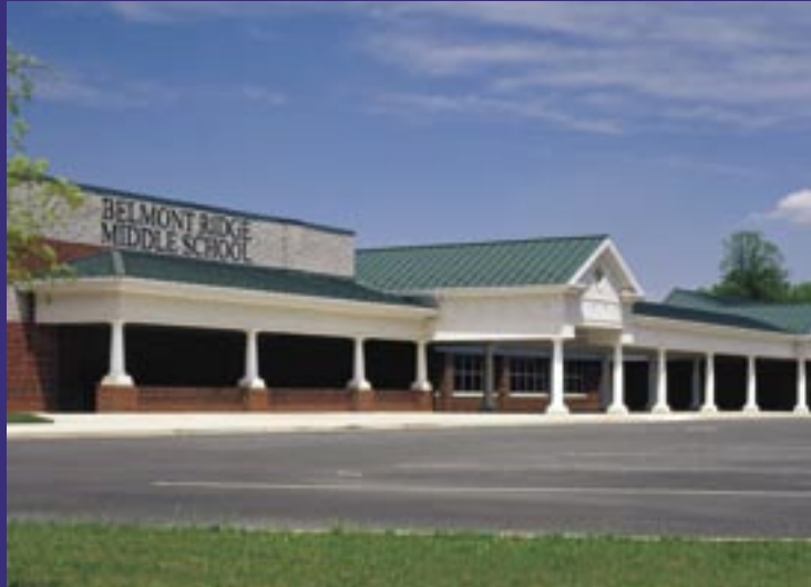
Belmont Ridge Middle School, ASHBURN, VA