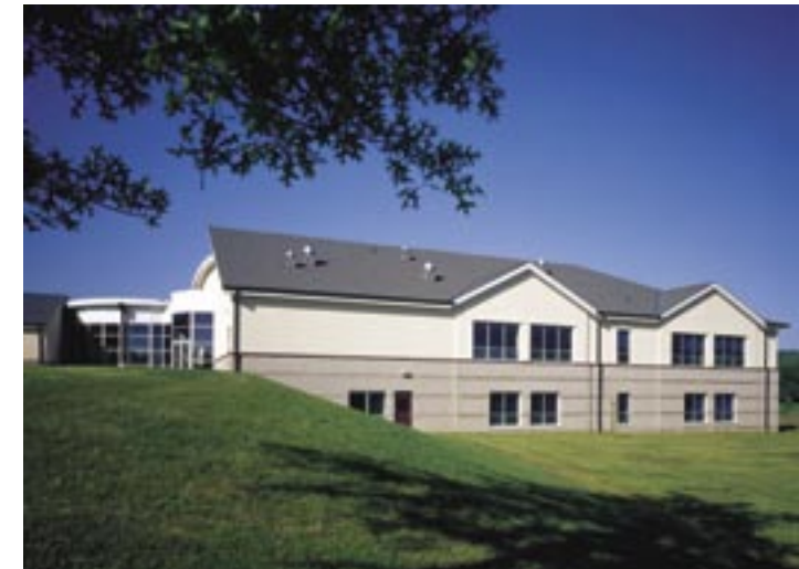
Highland School Center for the Arts, WARRENTON, VA

Whether your project is a hard-bid, design-build or PPP, the 'right' answer will always be Shockey.